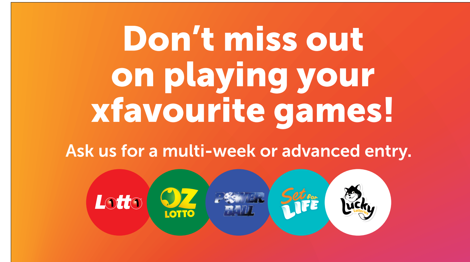
Frame 1 Messaging and game brands animate in.