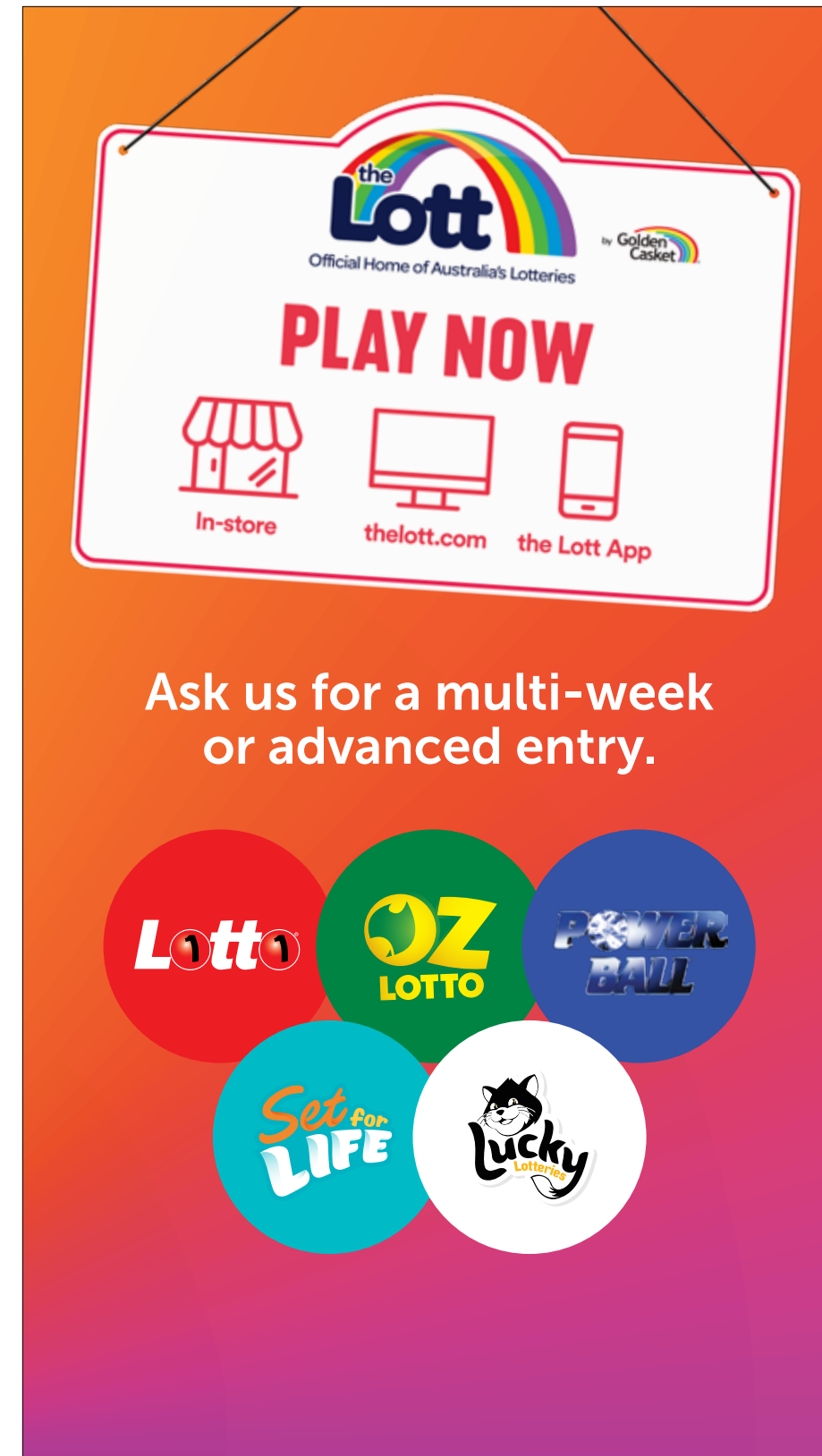
Frame 2 IOA device swings in and pushes out the headline, "Play Now" pulses.