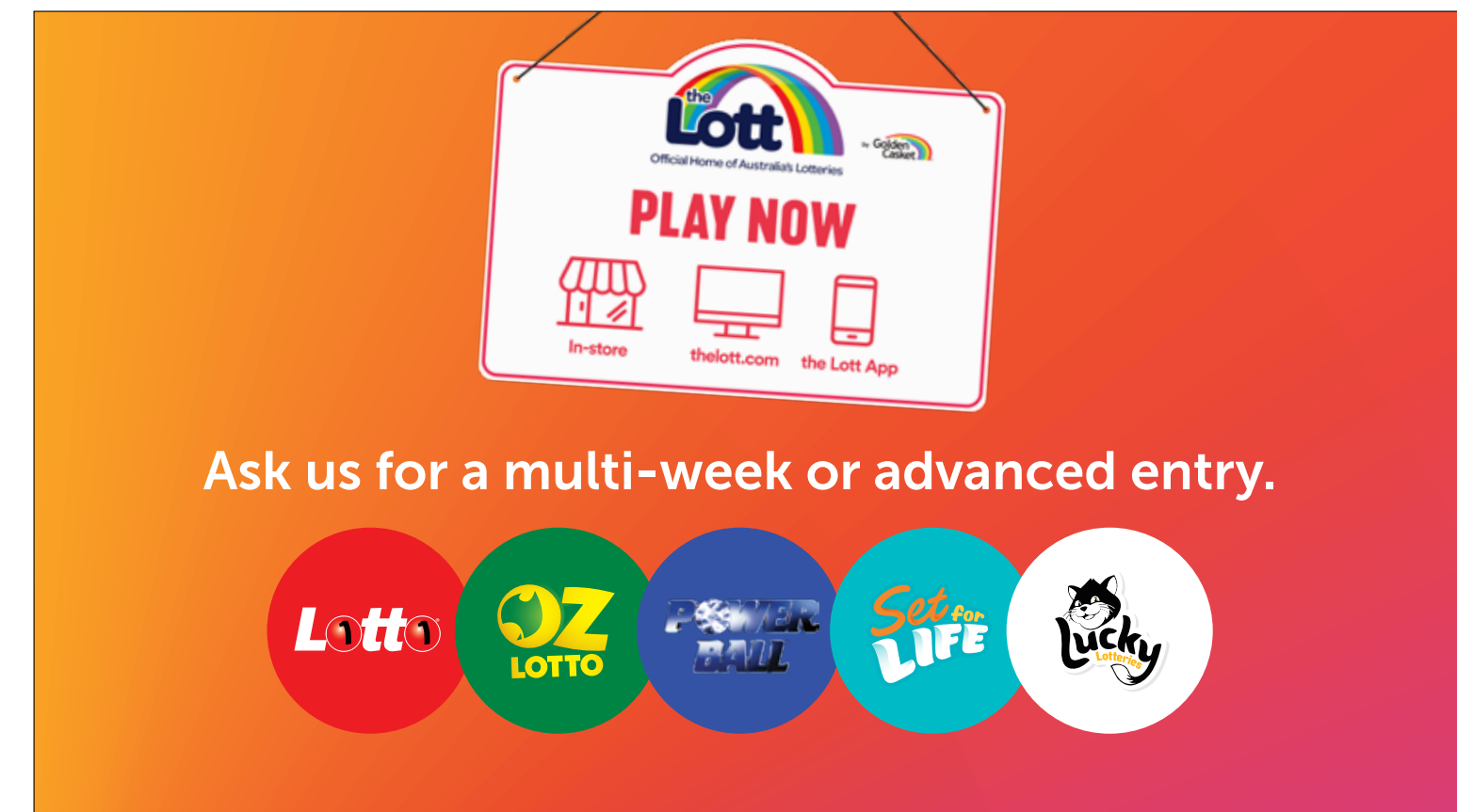
Frame 2 IOA device swings in and pushes out the headline, "Play Now" pulses.